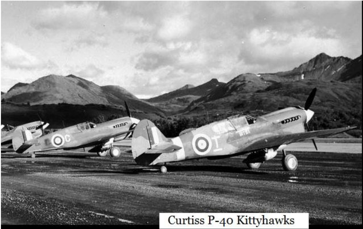
Curtiss P-40 Kittyhawks